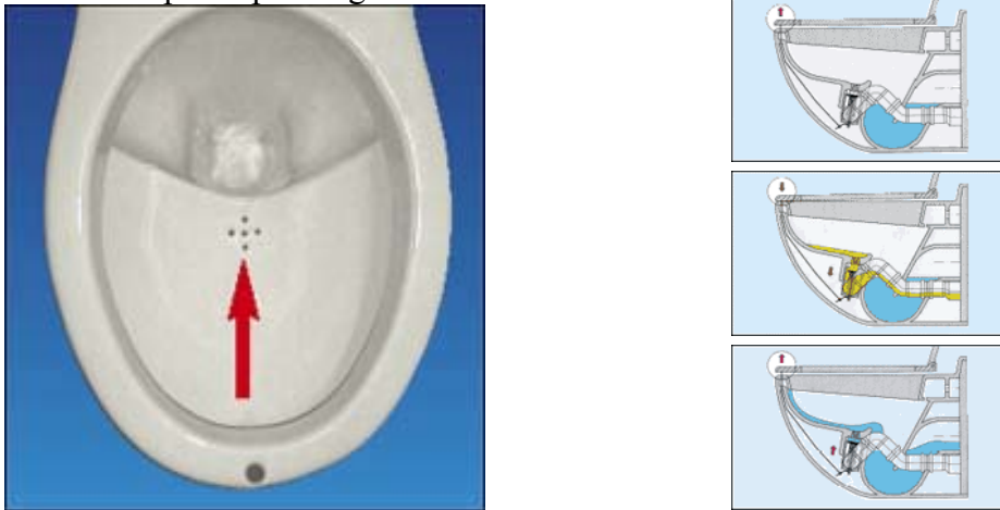
Figure 2. No-Mix-Toilets for separate collection of urine and faeces (www.Roevac.de)

Separating toilets have been developed in Sweden mainly. All of these toilets are draining urine with more or less flushing water, causing urine dilution and thus enlarging the storage volumes. A new developed separating toilet tries to avoid this disadvantage [Ulrich Braun, 2001] (s. Fig 2).