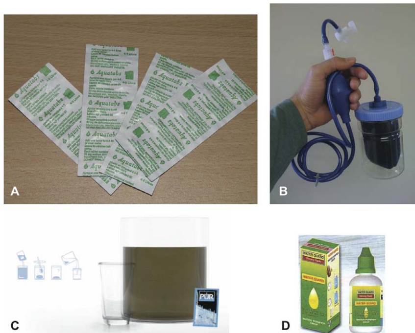
Figure 1. Tested POU Products. Aquatabs (A), the CrystalPur siphon filter (B), the PUR Purifier of Water flocculant/disinfectant mixture (C), and dilute hypochlorite solution branded as Water Guard (D). doi:10.1371/journal.pone.0026132.g001

The chlorine-based products all provide protection against recontamination until all the free chlorine has reacted with the walls of the storage vessel or with contaminants and metals in the