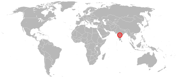
Fig. 1: Project location