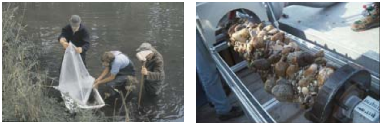
Fig. 4 Data-collection to Describe Ecologic Conditions Prior and Past Evacuation Measures: Sampling of Fish and Small Organisms (left) Freeze Core to Gain Grain Size Distribution of River Bottom (right)

Analysis has to cover hydrology, hydraulic conditions, morphology, floodplains and meadows, chemistry, organisms, structure of habitats, etc. and needs time-consuming data collection (Fig. 4). To be able to estimate the intensity of disturbances the data-collection has to be performed prior to the foreseen measures as well as following the evacuation action.