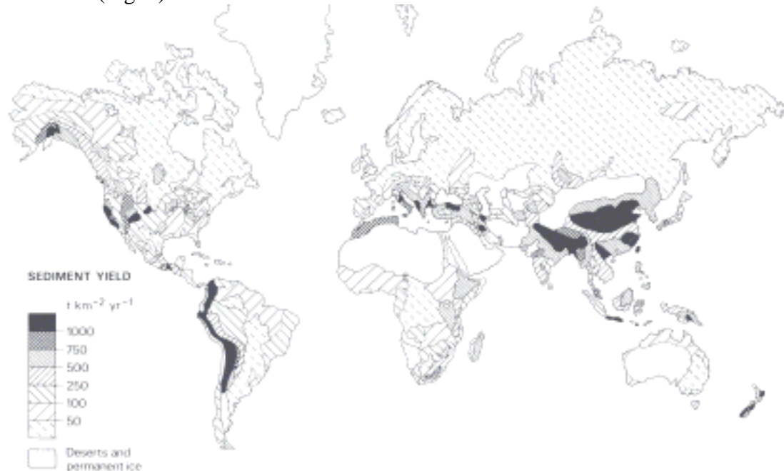
Fig. 1 Global Patterns of Sediment Yield (Walling and Webb, 1983)

In respect of sediment transport processes the specific hydrologic, geomorphologic, and climatic conditions of alpine regions are regarded as the major driving forces. The interaction of these different phenomena results in the highest sediment transport rates. Areas with the highest erosion rates are nearly identical with the major alpine areas worldwide: the Himalaya in the Asian region, the Andes in Southern America, the Pacific Coast of Northern America, and the Alps in Europe. Erosion rates of more than 1.000 t·km -2 per year can be observed on a global basis (Fig. 1).