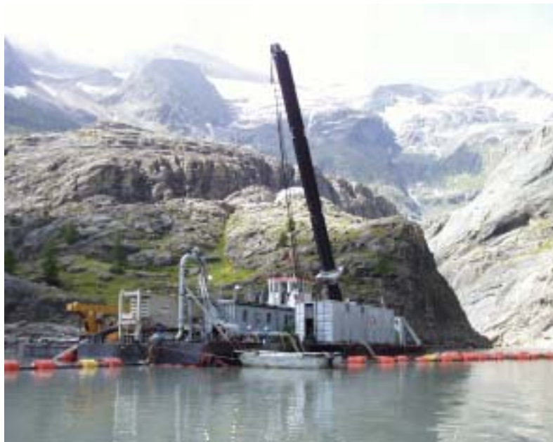
Fig. 3 Water Injection Dredger at Lake Margaritze (Austria)

All options, especially technical measures, encounter additional problems in the alpine environment compared to lowland applications. The specific conditions described in Chapter 2 affect time, duration and costs of sediment removal. Reservoirs at high elevations are often situated in remote areas with limited access making it difficult or even impossible to transport large equipment.