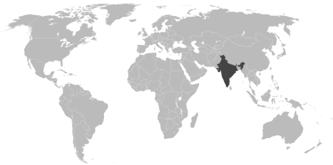
Fig. 1: Project location