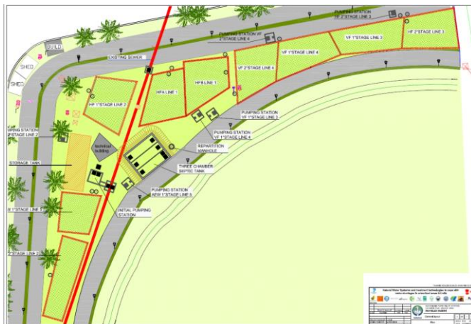
Fig. 3: Schematic of the treatment system