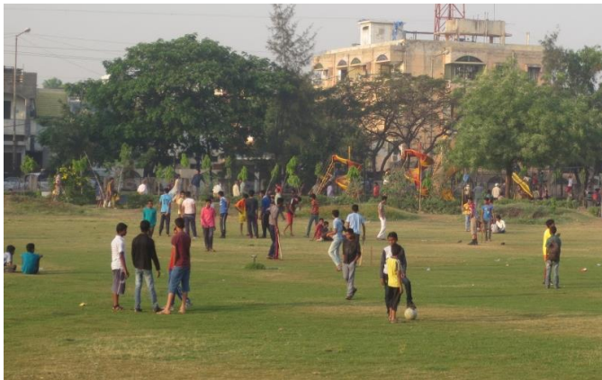
Fig. 4: Leisure activities in Dayanand Park