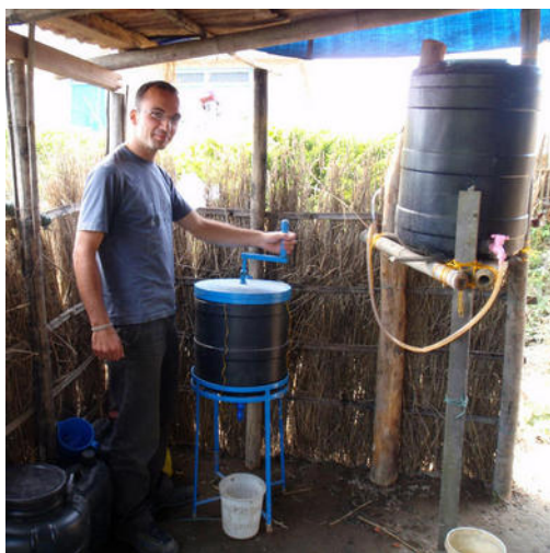
Struvite from urine researched in field laboratory setting (Photo: EAWAG).

The Swiss Federal Institute of Aquatic Science and Technology (EAWAG/SANDEC), together with UN-HABITAT Nepal, is conducting research on the production of struvite from urine in Nepal. Struvite is a phosphate mineral first discovered in medieval sewer systems in Hamburg, Germany, in the nineteenth century. It can be produced by adding a magnesium salt to urine, causing most of the phosphate and some of the nitrogen to precipitate and form white crystals that can be filtered out. The research – known as STUN – seeks to optimise the reactor and assess the economics of Struvite production.