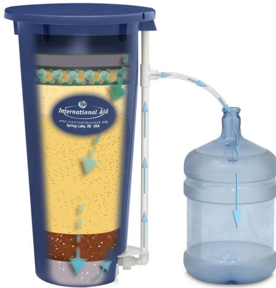
Cross Section of Plastic Biosand Filter