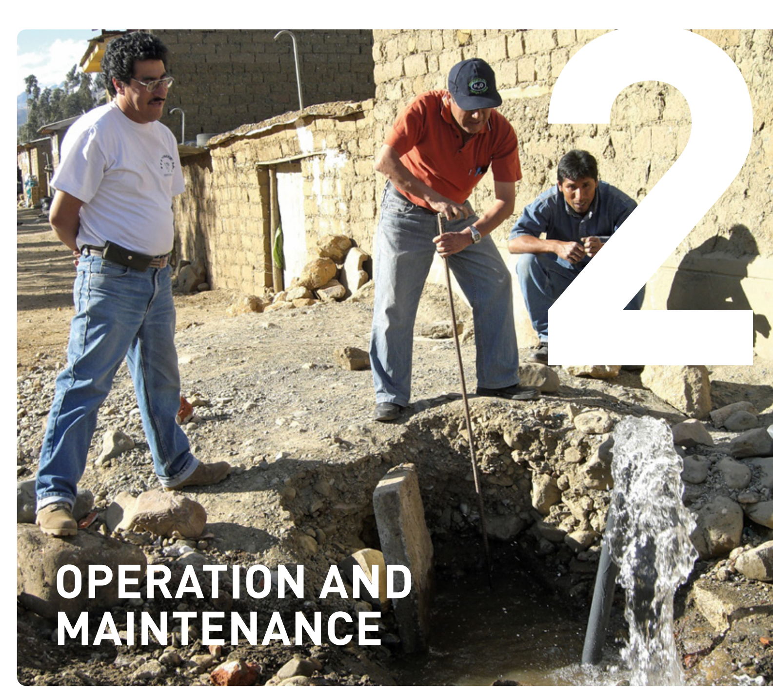
Network maintenance in Huaraz, Peru.