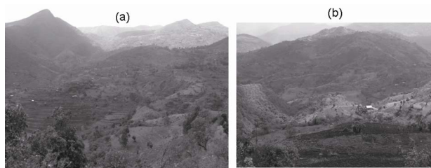
Figure 2. Partial view of the topography of the study site; Upper watershed (a) and lower watershed (b).

The silt and clay fractions showed significant difference ( P < 0.05 ) in croplands under LSB aged 6 year when compared with adjacent-nonterraced croplands while the LSBs aged 4 and 9 year was showed no significant difference in any fractions compared to adjacent-nonterraced cropland ( Table 1 ). In the SB aged 4