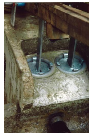
Concrete pump body