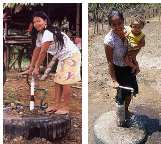
EMAS Flexi Pump