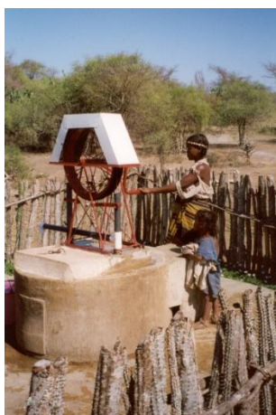
Extra strength rope pump