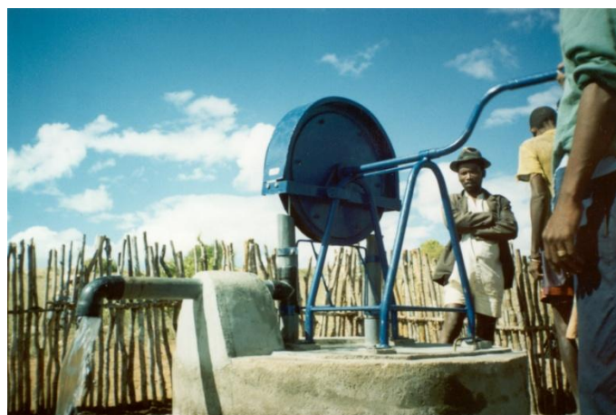
Madagascar type rope pump