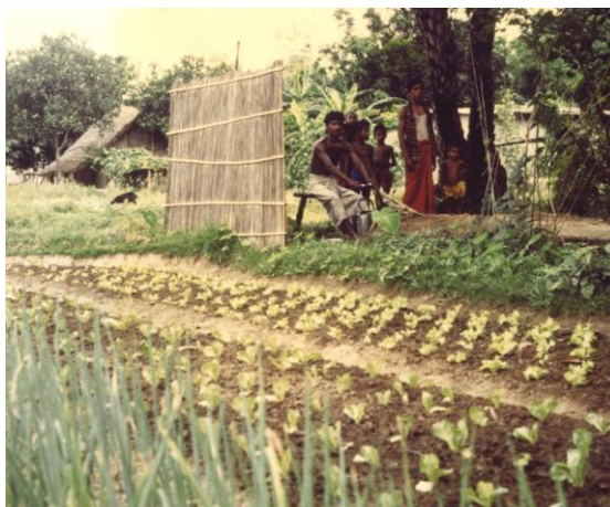
Small Scale Irrigation