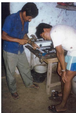
Building pumps by the owner