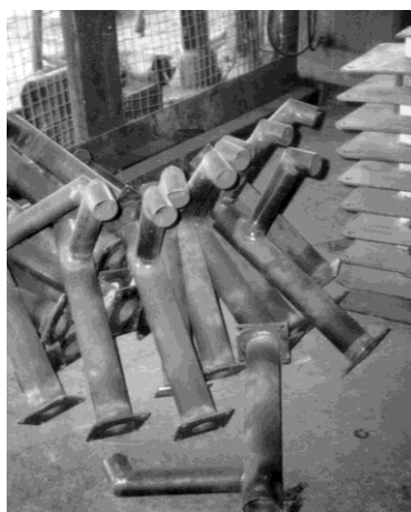
Industrial Production of handpumps