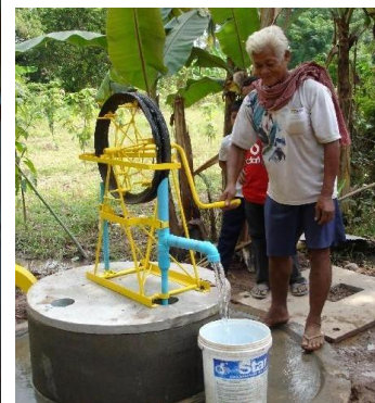
Vietnam type rope pump