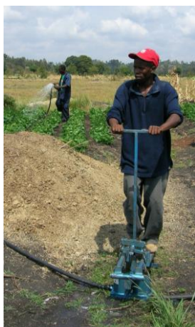
Money Maker Pump