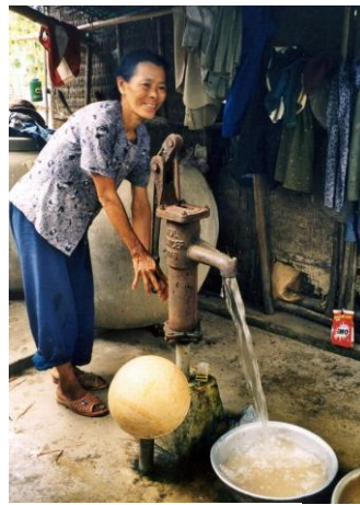
No. 6 Pump Vietnam